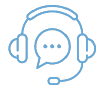
IT Help Desk